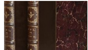
BOOK NOOK POETRY OF ROBERT BURNS