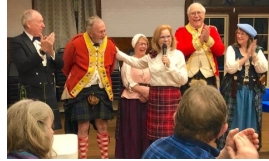
BEST DRESSED CONTEST