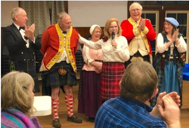
2020 Burns supper Best dressed contest