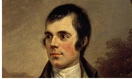
ROBERT BURNS NIGHT