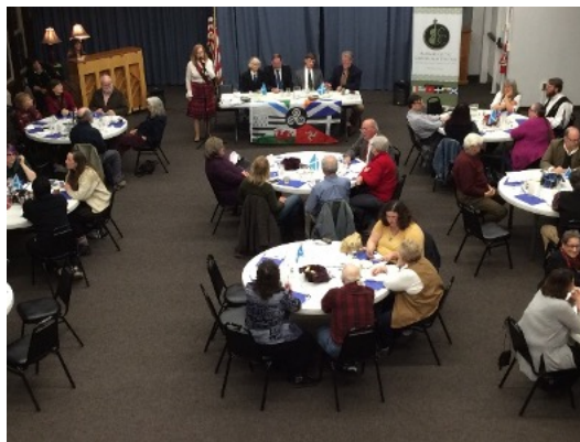
A typical Burns night program might look like this.

In the Celtic world January is the month to celebrate Scotland's Bard Robert Burns (1759 - 1796). For the last three years, Bangor Celtic Crossroads has held a fundraising event, a Robert Burns Supper. If you have attended, you know how much fun this can be. While we are unable to provide you with food and grog this year due to the pandemic, we are using this month's newsletter to focus on how this event is celebrated around the world.